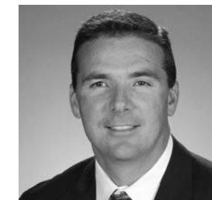
Urban Meyer University of Florida