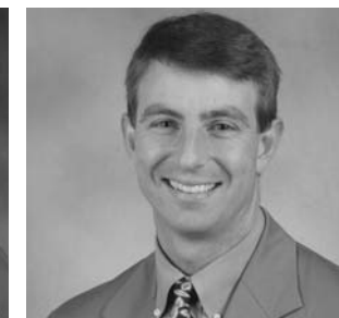
Dabo Swinney Clemson University